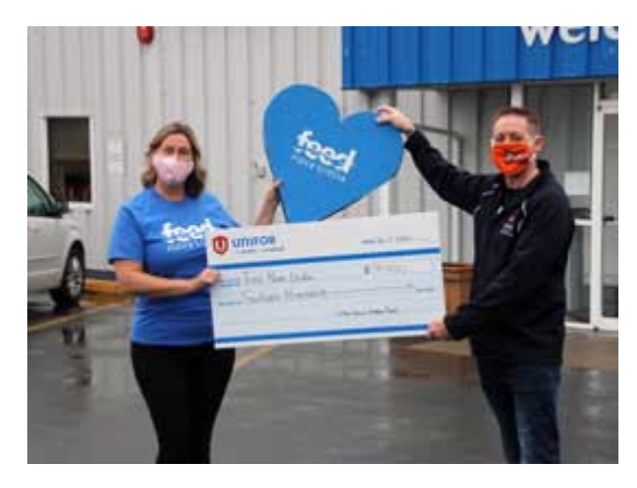
With people more in need across Canada this year than in recent history, lineups at food banks have been growing - and Unifor's Social Justice Fund is helping out by boosting its donations to food banks.