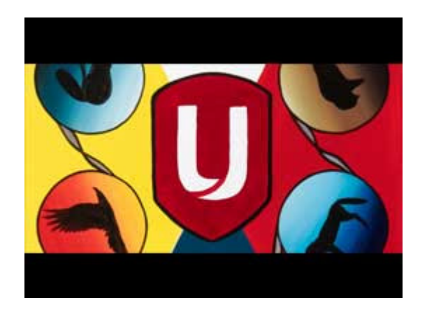
Register today for the next webinar in the Turtle Island series.